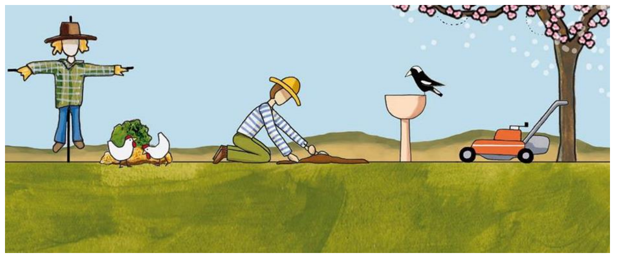
SCARECROW, NON-COMMERCIAL – MUST BE MADE AS SCHOOL PROJECT OR A PERSON/PERSONS SELECTED TO REPRESENT THEIR SCHOOL

ENTRIES: Entry is by online application at or by completing an entry form at the Show Office in Broadmeadow.